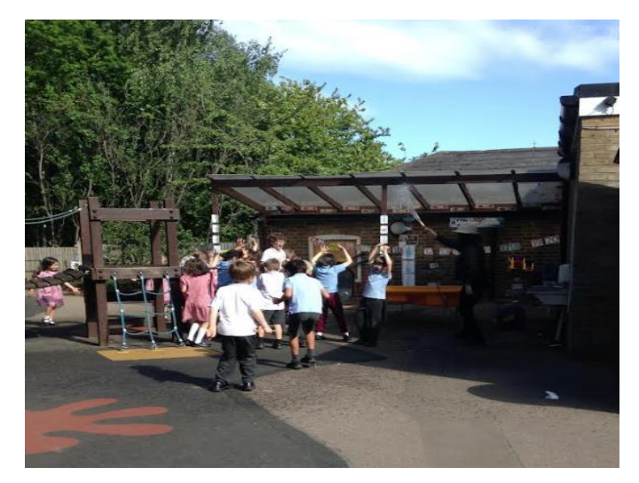
Year 1 & 2 – Enjoying a sprinkle from the hose on a hot day