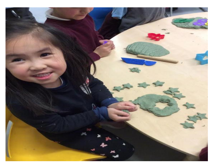
EYFS – Making stars with homemade playdough