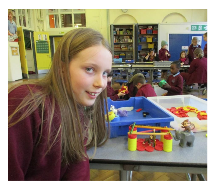
KS2 – Making a Monkey Elephant Playground.