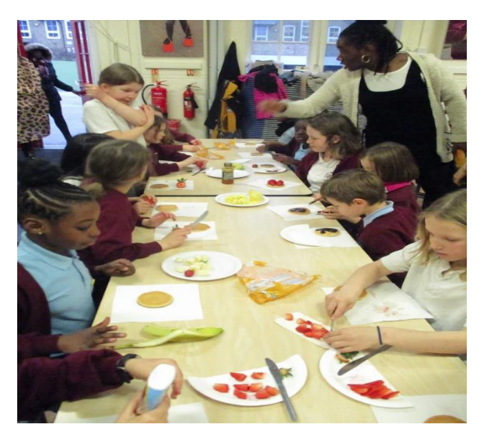
KS2 – Making yummy pancakes.