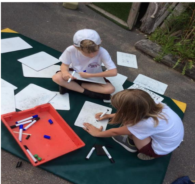
Year 1 & 2 sitting in the shade - playing hangman