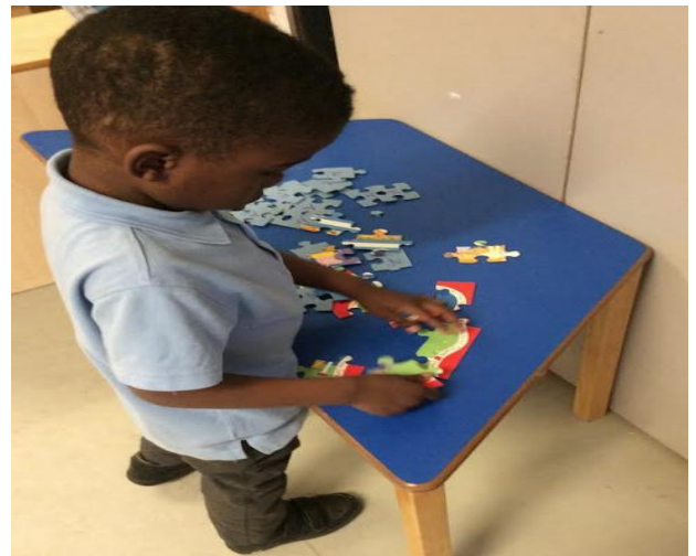
Puzzle time with Nursey and Reception