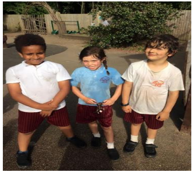
Year 1 & 2 – Having a cold down on a hot sunny afternoon