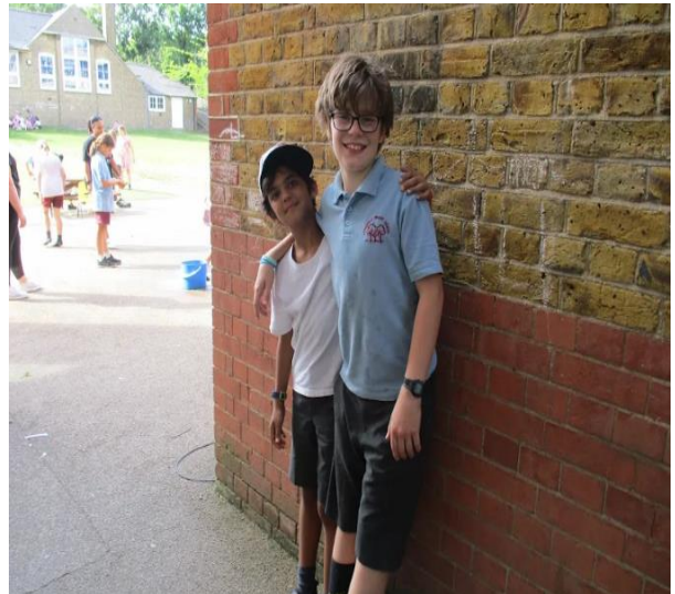
Really good mates