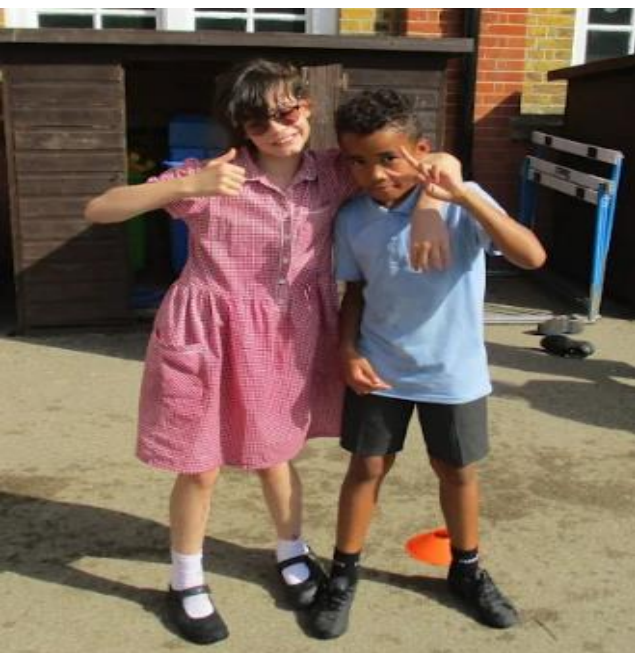
Having a fab time