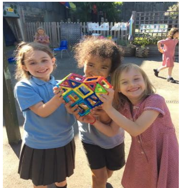
The girls made a magnetic love heart using Magformers