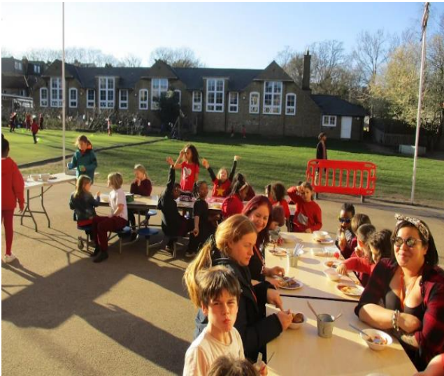
Dining al fresco