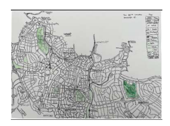
Map of a new section of London Noah Courtin