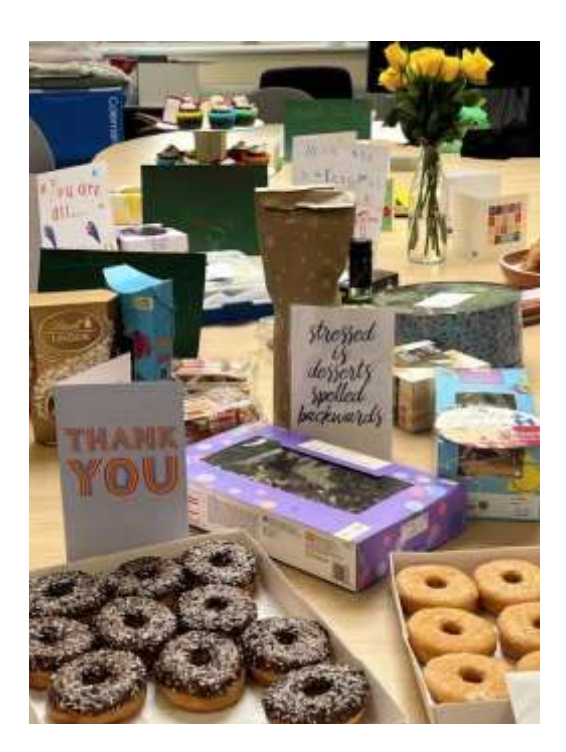
We feel the love! Sending you all a MASSIVE Thank You!

We, and the Ofsted inspectors, were thoroughly impressed by the huge number of parents who responded to the Parent View survey (when they looked at it there were 256 responses which is phenomenal - thank you so much) and the results were amazing too. Everyone has access to the results, so click here <a href="https://parentview.ofsted.gov.uk/parent-view-results/survey/result/20537/13">https://parentview.ofsted.gov.uk/parent-view-results/survey/result/20537/13</a>. We would also like to thank the 170 children who completed their survey. Whilst we don't have access to those results, it was reported that they were hugely positive, as were the staff surveys. Thank you for your support, as always.