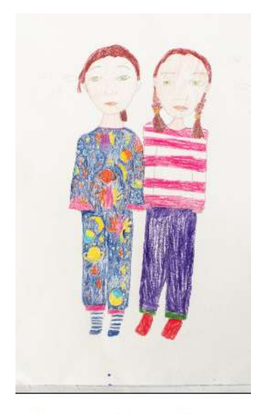
Identical Twin Sisters April Simmons Rush

We were extremely impressed by all the submissions from Hitherfield pupils. As ever they have shown themselves to be wonderfully creative and highly skilled, and we celebrate you all with great pride!