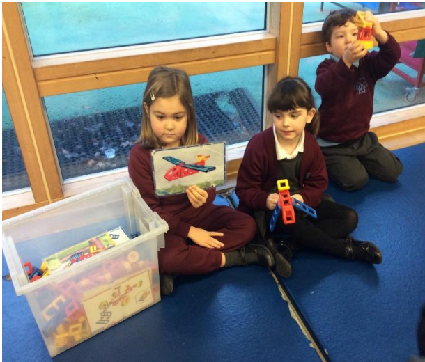
Nursery and reception - Friends who encouraged each other not to give up and completed their Mobilo creations!