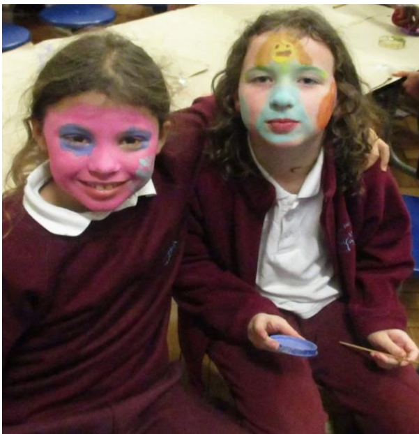
KS2 - Getting ready for our close up!