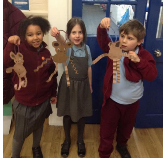
Back by popular demand! Year 1 and 2 enjoyed making cheeky monkeys!