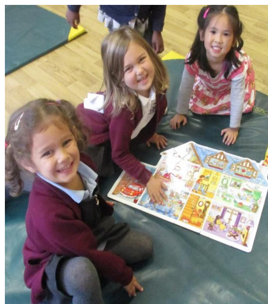
It's all very puzzling in Nursery and Reception Afterschool Club