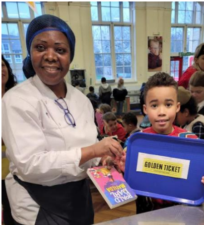
Here is the winner of the golden ticket!

Hitherfield dressed up to celebrate World Book Day 2022. We've had a series of author visits over the last few weeks and our celebrations culminated in parades around the school. It was great to see so many heroes and villains