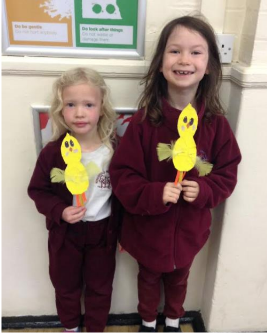
Year 1 & 2 making Easter Chicks! Happy Easter Everyone!