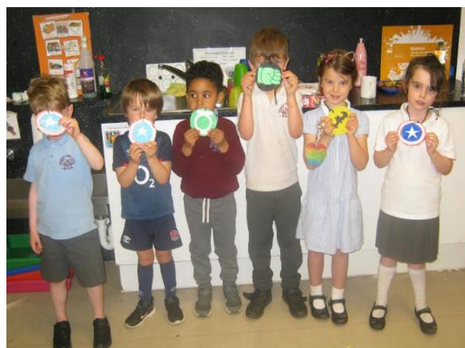
The finished result!!