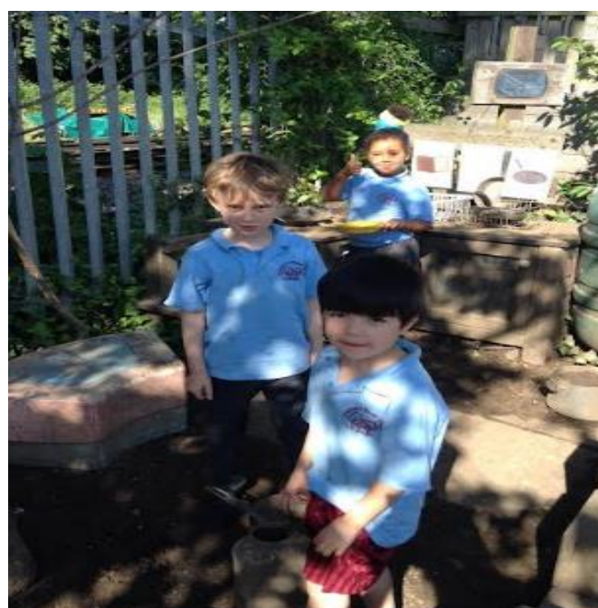
Our chefs creating delicious foods in the mud kitchen