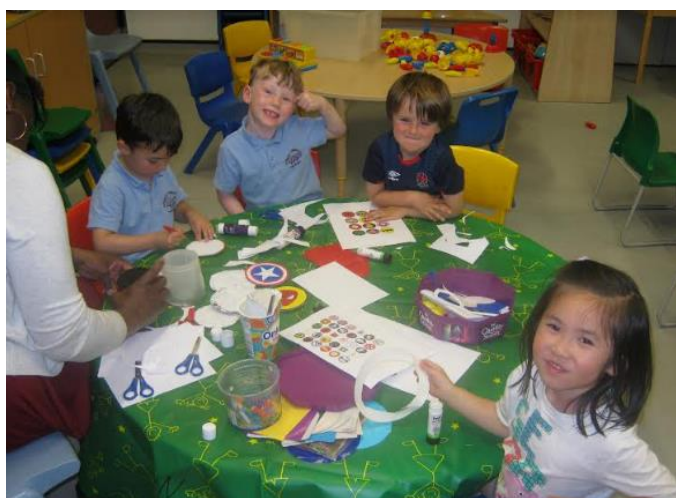
Nursery and Reception creating Superhero Crests in Afterschool Club