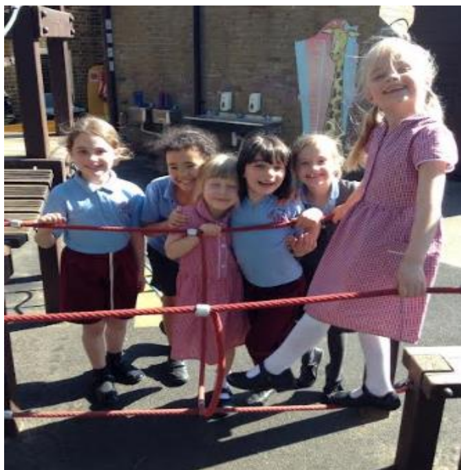
Year 1 and 2 enjoying the Sunshine – Smiles all round