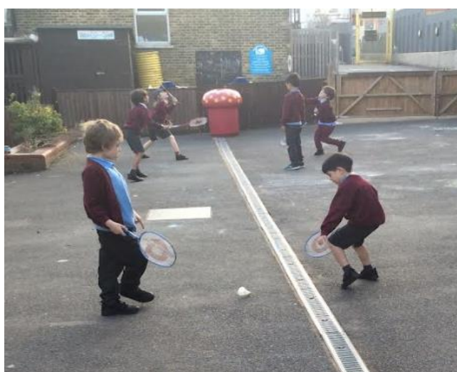
Year 1 and 2 playing badminton.