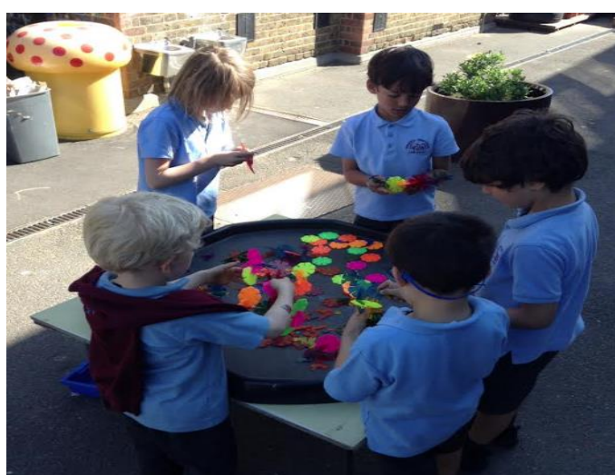
Year 1 and 2 being creative with the octons.