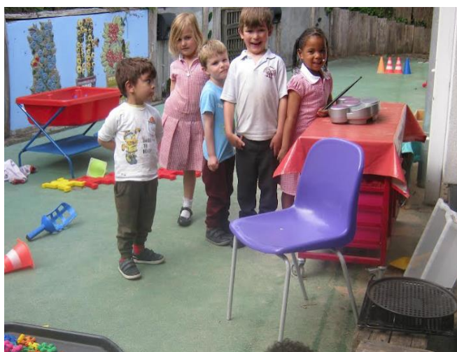
Nursery and Reception - Turn taking on the drums.