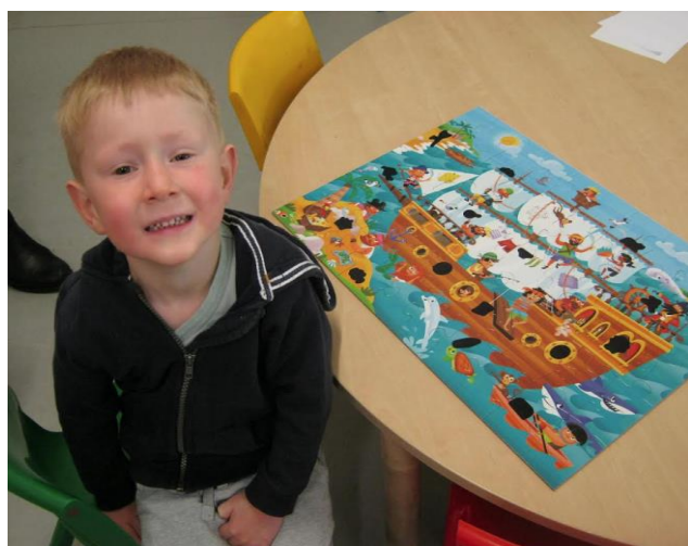
Feeling very proud after completing the puzzle.