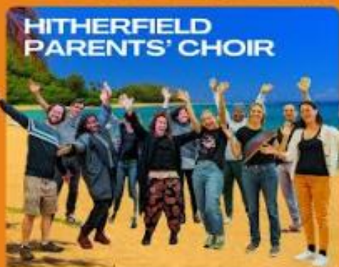
HITHERFIELD PARENTS' CHOIR