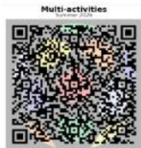
Multi-activities Summer 2026

Hitherfield Primary School, Leigham Vale, Streatham SW16 2JQ