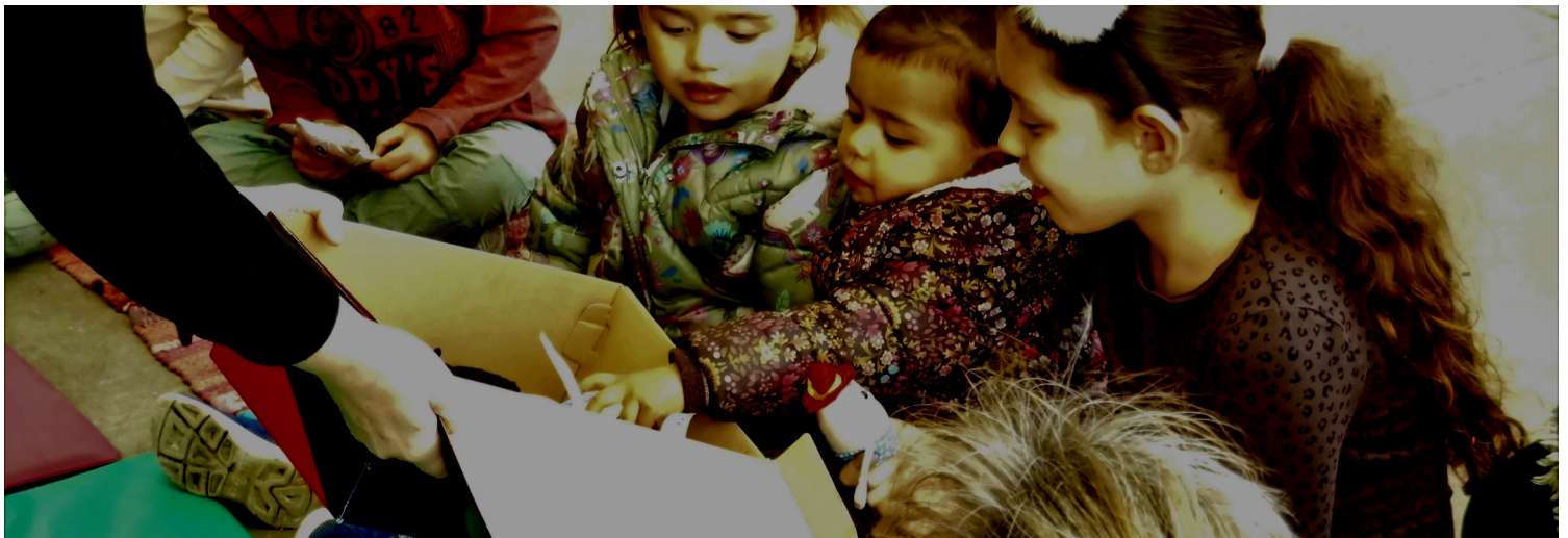
What's in the box? Circle time at Hillside Gardens One O'clock Club!