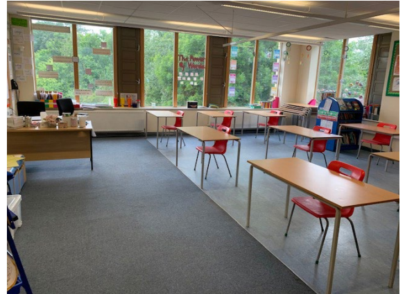
CLASS USED BY YEAR 6