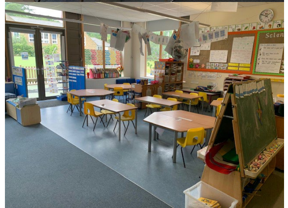
CLASSES USED BY YEAR 1