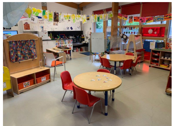
CLASS USED BY RECEPTION