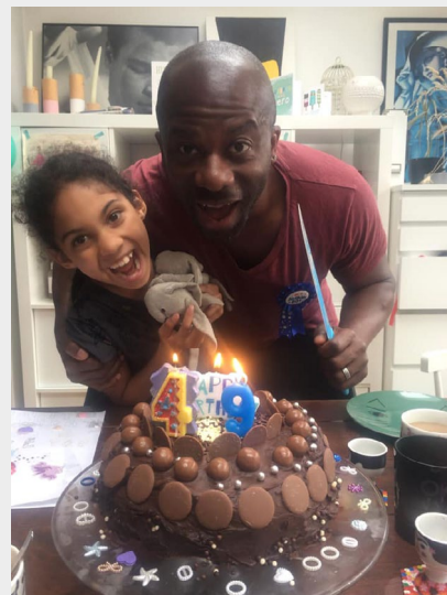
3rd Place: Ella's Chocolate Birthday Cake