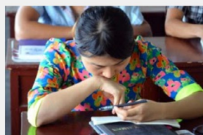
Homework Help