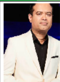
ITV's "Chaser" Paul "The Sinnerman" Sinha